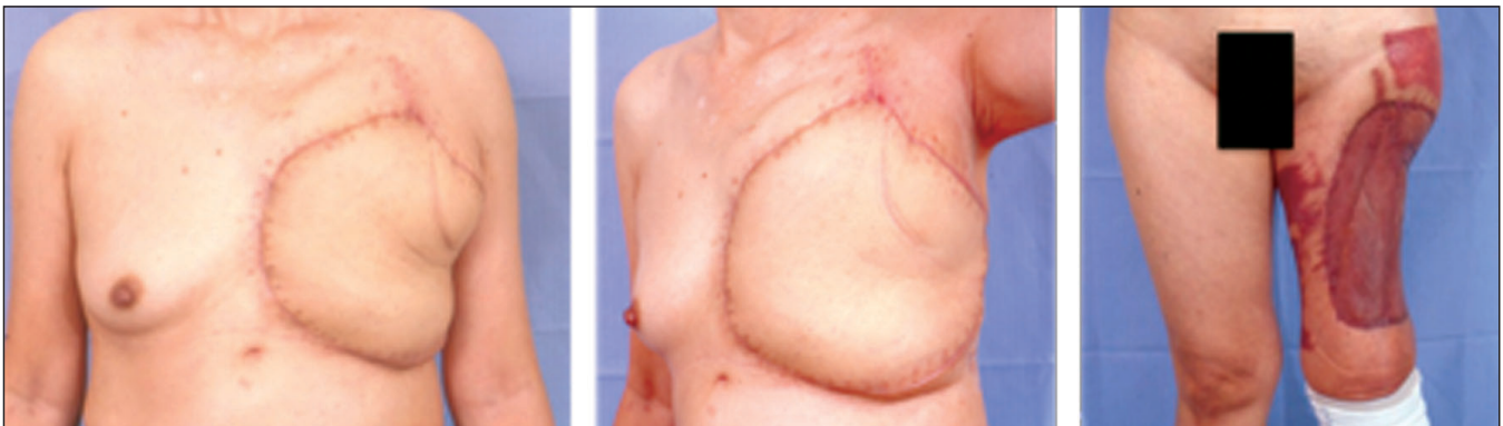
Figure 4: Six months postoperatively