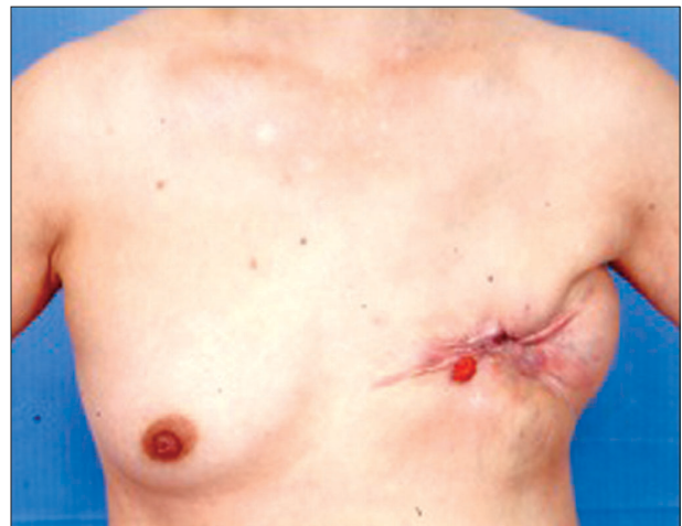
Figure 1: Recurrent cystosarcoma phyllodes

transversely was found adherent to the chest wall, invading the skin, ribs and pleura. The thoracic surgeon resected the entire left anterolateral chest wall from the midsternum to the midaxillary line, comprising skin,